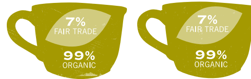
2010 2011 TEA SOURCING

Fair Trade sets a bottom price for living-wage prices. We pay more. Rainforest Alliance works to conserve biodiversity and ensure livelihoods. We do more. Whole Trade means higher standards. We do all of this while producing some seriously excellent coffee and tea. We manage to care completely about how each and every one of our products is produced while simultaneously creating beautiful tastes.